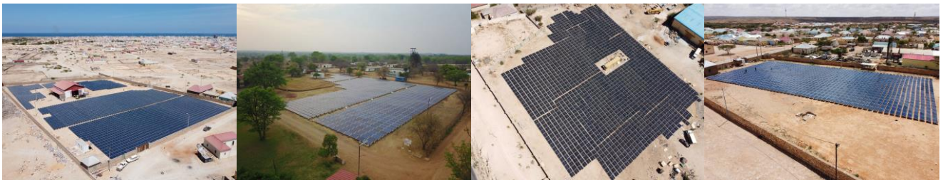
1.1 MW diesel grid, Puntland

Our business model is simple and risk free: we design, build, operate, maintain and insure solar power plants at our own expense. This means, there is no investment required from our clients. We simply charge you an operation fee for the solar electricity that you use on a per kWh basis at substantially lower cost than your grid and or diesel electricity supply. Our cost savings against diesel electricity typically exceed 60 % .